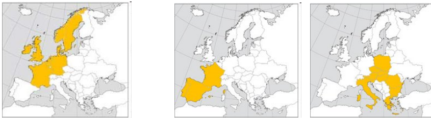
Regulators' Regional Initiatives for Gas

In 2006, European Regulators and the European Commission set up a Regional Initiative Framework for Regulatory Authorities. Due to the fact that cross-border issues cannot be dealt with effectively by national regulators and that supranational regulation does not exist so far, regional regulatory cooperation seems to be one possible track towards market integration. By creating seven regional electricity initiatives and three regional gas initiatives, the first steps towards the interim regional market development were taken. Conduct and organisation were assigned to ERGEG. One central idea behind the Regional Initiatives is to bring all key stakeholders, including the European Commission, regulators, transmission system operators, market participants and member states together. 24 This also gives the regulator the opportunity to create new market dynamics and to ensure 'market discipline' in order to achieve the determined goals. At the same time, as Glachant and Lévêque argue, regulators could not be held responsible for everything happening in the markets. 25